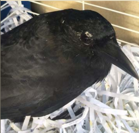
Here is Poe the Crow, thanking you kind readers and your outlaw friends for all those animal rescues.

You know what happens. The cardboard box with an old towel and the injured ( fill in your animal ) is in a quiet, warm place. You searched the internet for advice on care and feeding for your baby, ignoring advice to consult a licensed wildlife rehabilitator. It's a 60 mile drive to one who takes your species, and you fear they will let it die alone in a cage. Your vet won't treat wild animals. Those little eyes are looking at you for help... and so, you become an outlaw. It is no coincidence that Jean's early books feature rescued animals while newer books focus